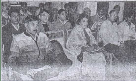
कार्यशाला में उपस्थित लोग। • हिन्दुस्तान