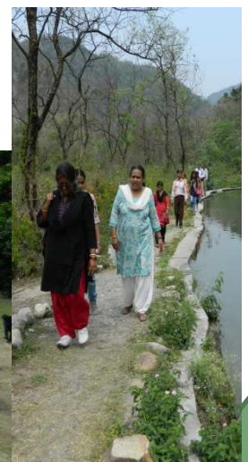
A groups of Corporate visited our Himalayan Gram picnic spot