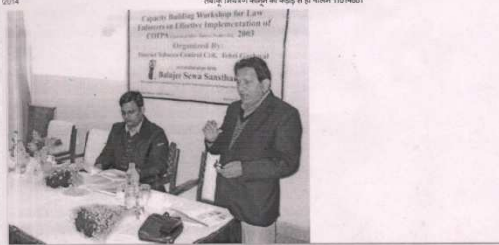
तंबाकू सहयोगी, नई टिहरी: