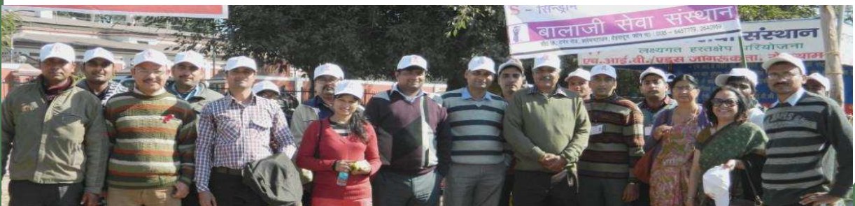
Team and Official's of Uttarakhand Aids Control Society with member secretary on celebration day of HIV-AIDS Day on 1 st Dec 013

Emphasis has been on identifying the HRG people and counsel them to going for testing, treatment of sexually transmitted diseases and if found infected with HIV, to take them to the ICTC for treatment and counsel them on how not to spread the disease and how to live with the virus. Counseling helps people to understand that they can lead a normal life, provided they take ART and keep a positive attitude.